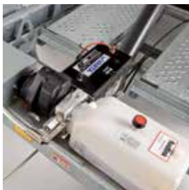
Electric Hydraulic Tip