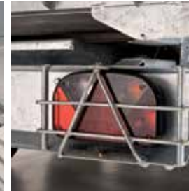
Rear Light Guards