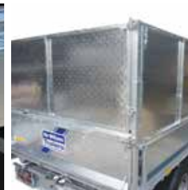
Solid Side Extensions